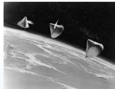
A re-entry simulation of the spacecraft