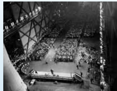
Most of the Launch Support Team gathers in the aisles of the VAB to hear the astronauts thank us for a job well done