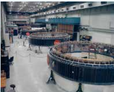
IBM's Instrument Units (IU) arrive at the Cape