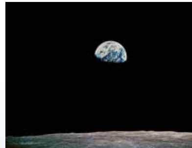
Earth rise say it all...we are one!