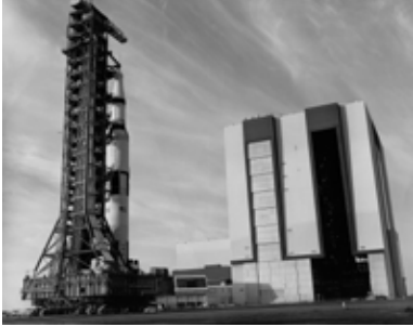
The transporter carries the unfueled vehicle at speeds slightly under one mile per hour