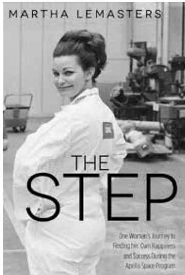
THE STEP BY MARTHA LEMASTERS