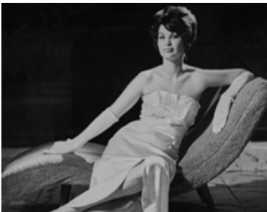
A glamour shot of me in the early 60's.