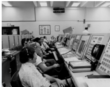
IBMers man their consoles in the Launch Control Center (IBM)