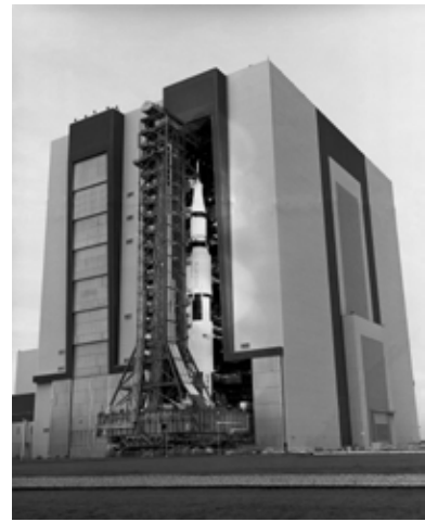
The 363-ft. high Apollo 14 Saturn space vehicle leaves the VAB