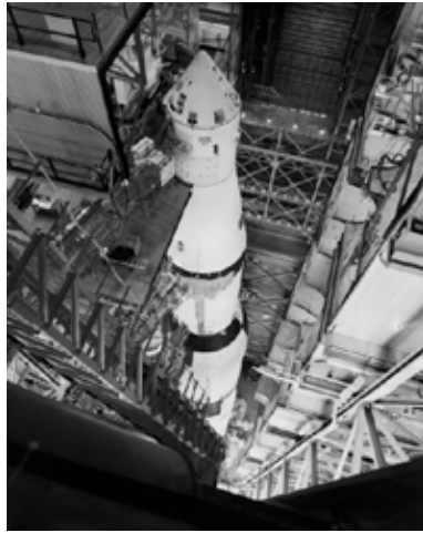
The spacecraft is attached above the IU to complete the Saturn V