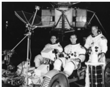
Jim Irwin, Dave Scott and Al Worden try out their lunar rover before the launch of Apollo 15