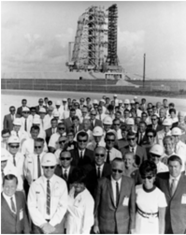
Some of the many IBMers who worked at Cape Kennedy during the early 60's.