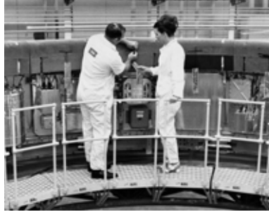
I don the required white coveralls and get inside the IU for one writing assignment (IBM)