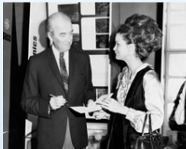
Movie star Jimmy Stewart signs my MFA Program the night before Apollo 11