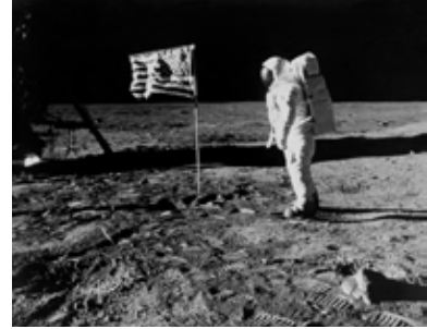
Ed Aldrin poses for a photo on the moon beside the deployed U.S. flag during Apollo 11